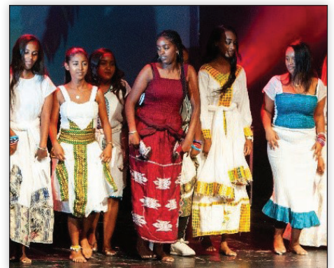
Participants of IsraElite women's mechina celebrate Ethiopian holiday of Sigd.