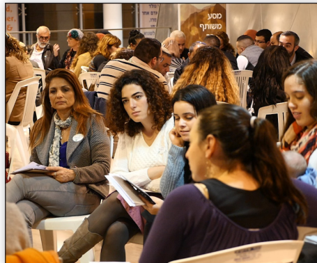
Village Way is taught at university level.